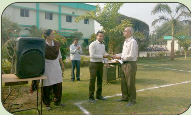
A motivational certificate awarded for 'Highest Attendance' for the calendar year 2016.